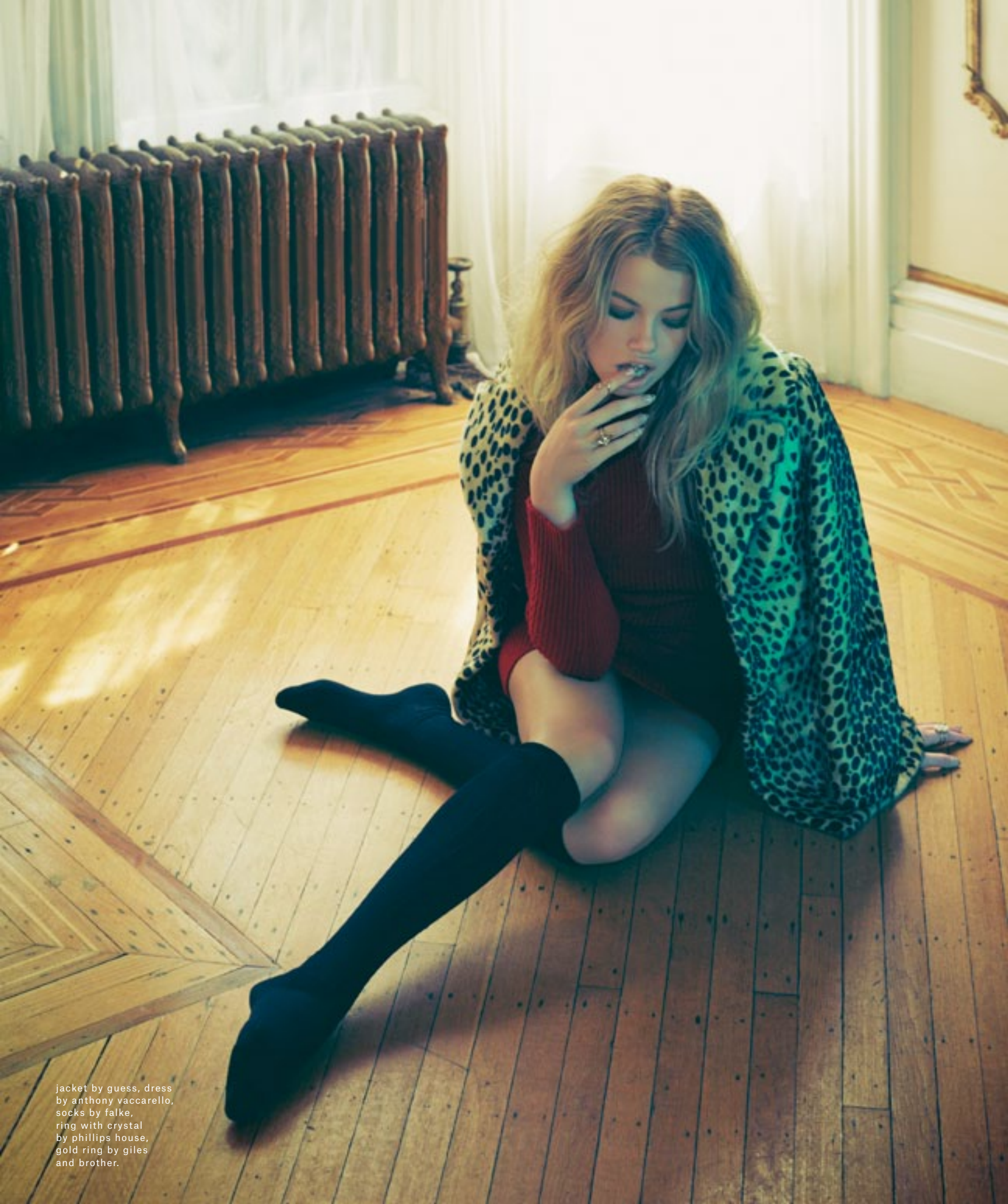
jacket by guess, dress by anthony vaccarello, socks by falke, ring with crystal by phillips house, gold ring by giles and brother.